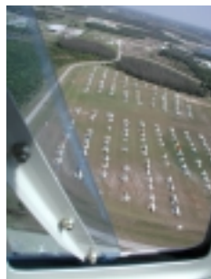
A few people camping out