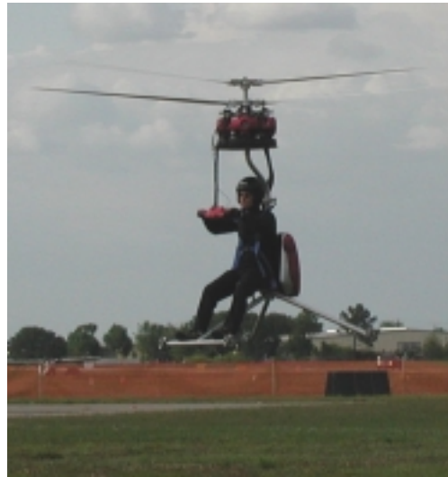
Powered by stupidity?