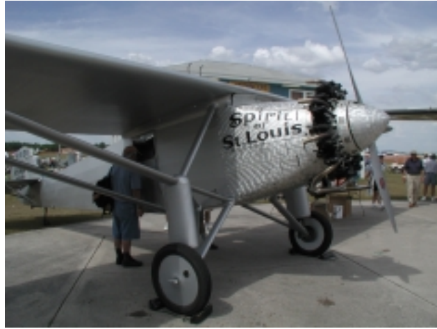
Two kinds of spirit!