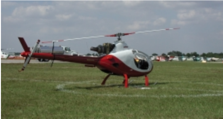
A turbine powered Rotorway Exec