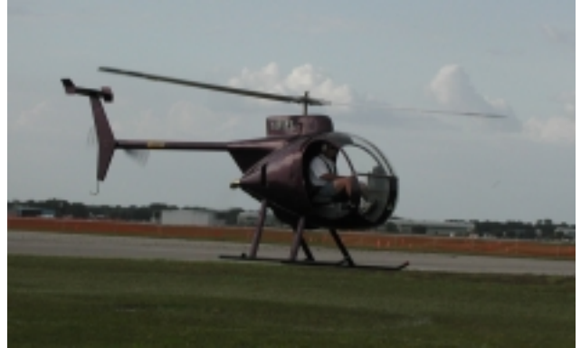
A turbine powered Mini-500