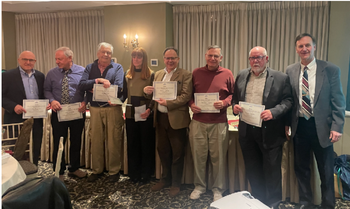
Officers and Position Holders