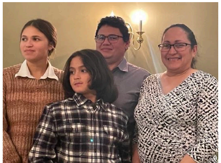
The Aponte family – "The Exceptional Family Service Award"