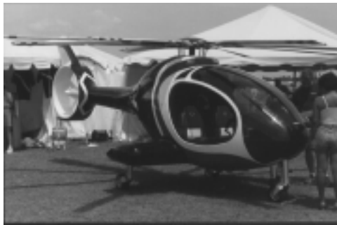
The new JAG kit from Rinke Aerospace