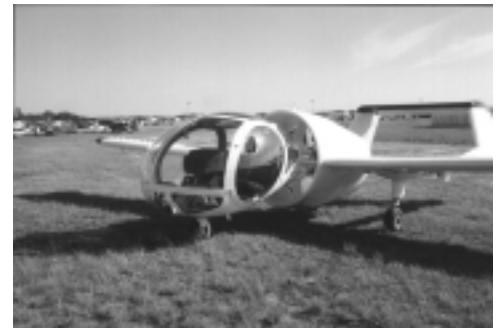
Some things are just too weird...