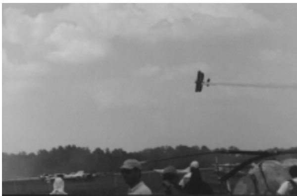
This jet-assisted Waco biplane was a daily sight!

34,744 feet. Here are a few photos from the venue. Remember, Oshkosh is just around the corner!