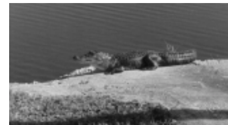
Visitors came from all over the world