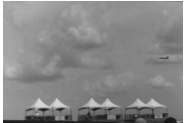
A Navy F-14 fly-by over the judges stand