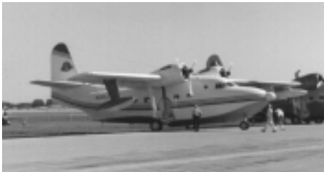
Jimmy Buffett's Grumman Albatross