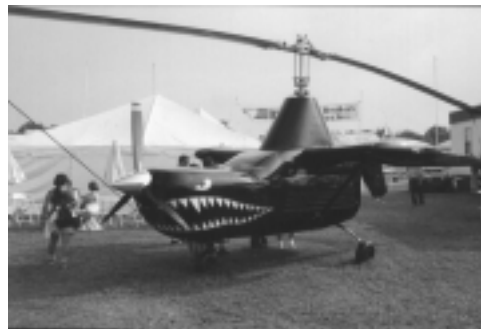
Stay outta his way! GBA's concept load-hauler made from a Cessna Skymaster airframe