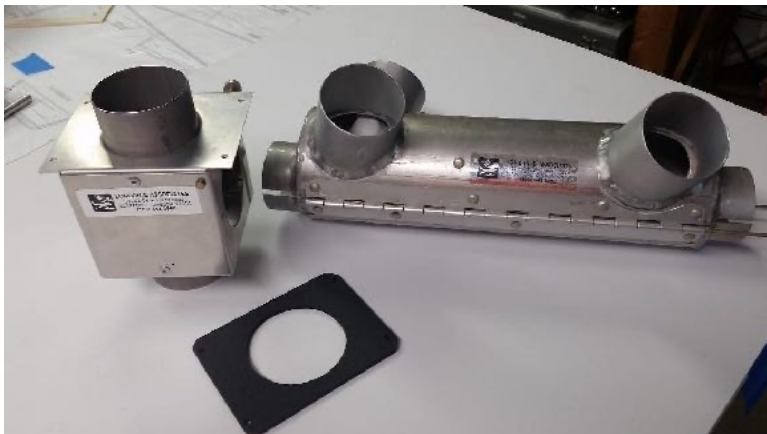
New/unused London & Associates Heat Muff and Firewall Airbox with Valve